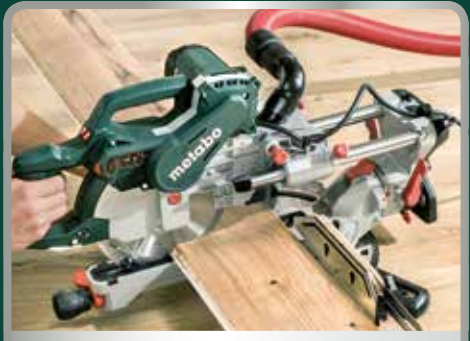
Compact traction function for wide workpieces up to 305 mm

Extremely compact thanks to incorporated traction bars, no space required behind the saw